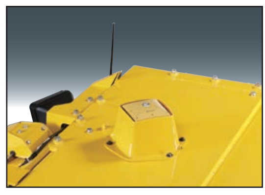
All components for machine control are factory-installed during assembly at the Komatsu manufacturing facility, ensuring reliability and high quality.