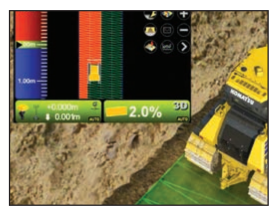
Surface track mapping: cab top GNSS antenna collects accurate "as-built" surface data. It measures actual elevations, as the machine continuously tracks in operation.